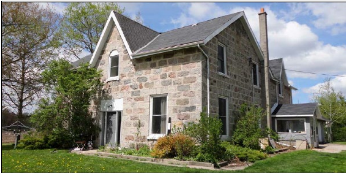
Photo of front façade (Cultural Heritage Evaluation Report, prepared by Unterman McPhail Associates, 2012)

Description of Historic Place: 219 Farley Road (formerly 7708 Colborne Street) is located on Plan 61M-245, Block 279 (formerly Lots 19 and 20, Concession 14), in the Township of Centre Wellington, County of Wellington (former Nichol Township). The property is located on the south-west side of Farley Road, north of Colborne Street. The property is approximately 0.3 acres and currently supports a single 1.5 storey former dwelling. It is surrounded by a new residential subdivision. The property is shown in the images below.