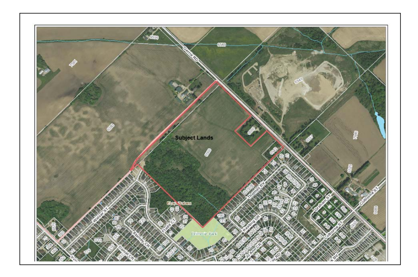
Figure 1: LOCATION PLAN

Figure 1 identifies the subject lands. The property is located on the west side of Gerrie Road and north of Thomas Boulevard. It is opposite the Township's waste transfer station which is located on the east side of Gerrie Road. According to the County of Wellington Official Plan, this property is located in the northeast quadrant of the Elora Urban Centre, adjacent to the "Built Boundary".