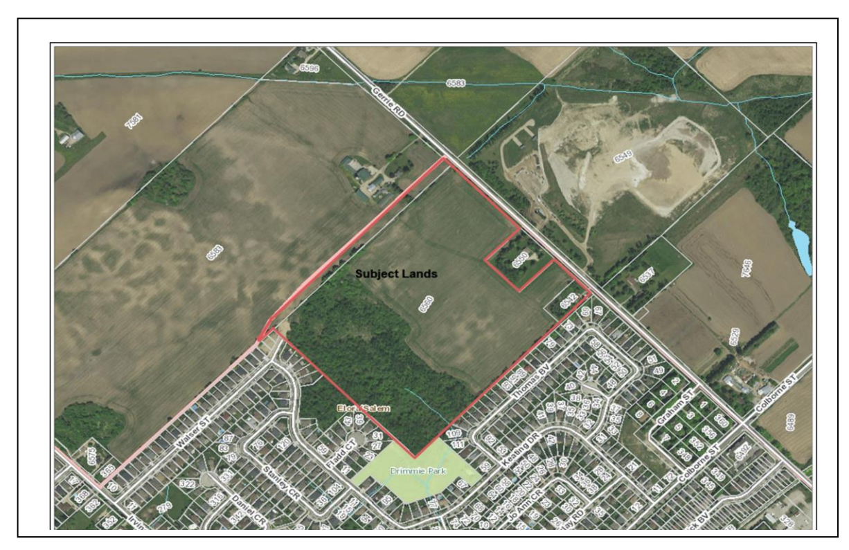
Figure 1: LOCATION PLAN

Figure 1 identifies the subject lands. The property is located on the west side of Gerrie Road and north of Thomas Boulevard. It is opposite the Township's waste transfer station which is located on the east side of Gerrie Road. According to the County of Wellington Official Plan, this property is located in the northeast quadrant of the Elora Urban Centre, adjacent to the "Built Boundary".