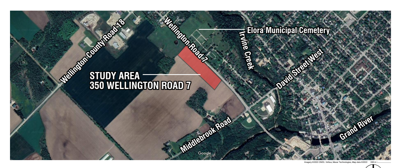
FIGURE 1 - KEY MAP (N.T.S.)

Schollen & Company Inc. was retained by We Merchandise Space Inc. to complete an inventory of the trees that are located within and immediately adjacent to the Study Area, which is located at 350 Wellington Road 7, Elora. The Study Area is illustrated on the Key Map above (Figure 1).